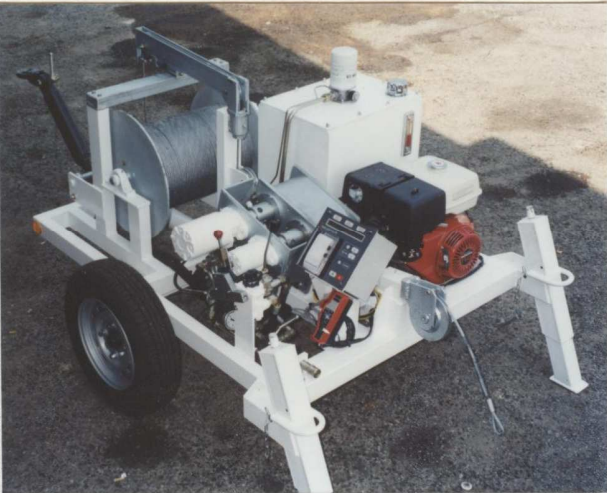
WINCH TR 2500