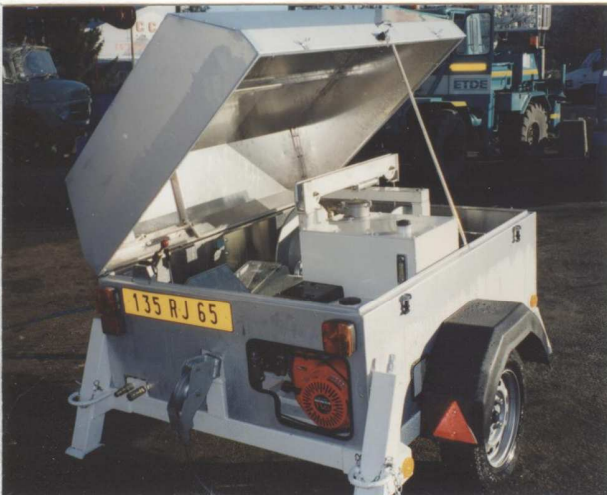
OPENED PROTECTION STRUCTURE