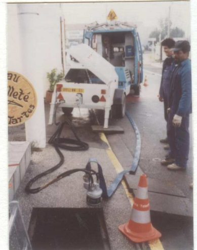
SUBMERSIBLE PUMP ( OPTION )