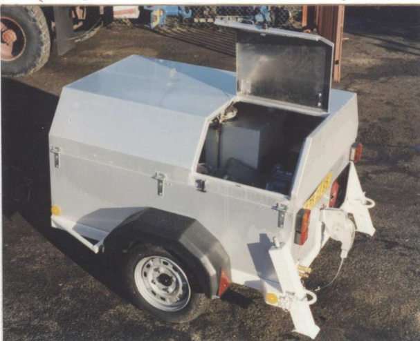
PROTECTION IN WORKING POSITION